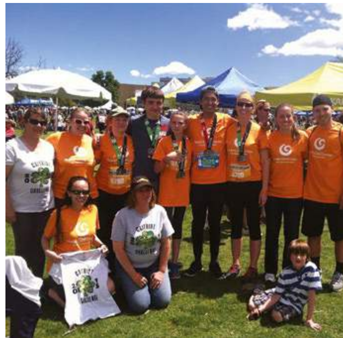
World Child Cancer USA's 2015 Colfax Marathon Team Photo caption

We would like to offer our heartfelt thanks to all of our wonderful supporters. Thank you to all of our volunteers, interns, and event participants – we truly appreciate your support.