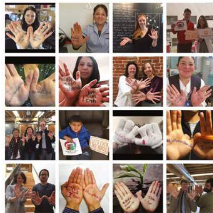
World Child Cancer supporters raising awareness for World Cancer Day 2015